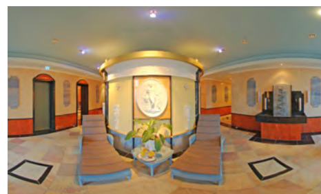
Sauna indoor area