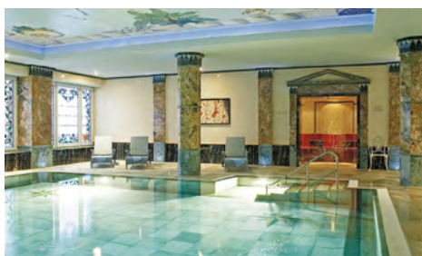
Thermal indoor pool

The day of arrival and the day of departure are each counted as half a day.